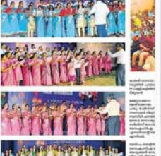
കോൺഫറൻസിന്റെ ഭാഗമായി സെന്റ് ഹാൽ തീരത്ത് നടന്ന കവിതാപരിപാടി. മലങ്കര സോഷ്യൽ സർവീസ് സൊസൈറ്റിയിൽ പങ്കെടുത്തവർക്ക് പരിപാടികൾ സംഘടിപ്പിച്ചു.