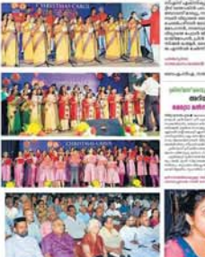
കോൺഫറൻസിന്റെ ഭാഗമായി സെന്റ് ഹാൽ തീരത്ത് നടന്ന കവിതാപരിപാടി. മലങ്കര സോഷ്യൽ സർവീസ് സൊസൈറ്റിയിൽ പങ്കെടുത്തവർക്ക് പരിപാടികൾ സംഘടിപ്പിച്ചു.