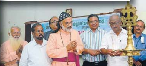
കോൺഫറൻസിന്റെ ഭാഗമായി സെന്റ് ഹാൽ തീരത്ത് നടന്ന കവിതാപരിപാടി. മലങ്കര സോഷ്യൽ സർവീസ് സൊസൈറ്റിയിൽ പങ്കെടുത്തവർക്ക് പരിപാടികൾ സംഘടിപ്പിച്ചു.