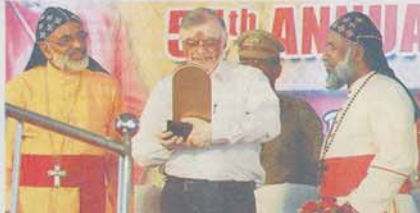
Governor P Sathiasivam taking a look at the memento presented by Cardinal Basileos Cleemis (right) at the inaugural function of the 54th annual conference of Malankara Social Service Society held in the city on Friday

Karmohav is conducted to kick off the society's plans for the next year. This year, the society, with the support of Ministry of Rural Development, plans to train 1,400 youth in various trades and empower them to take charge of their lives. The society also plans to replicate the project in Karnataka, Madhya Pradesh, Maharashtra and Chhattisgarh.