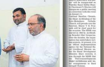
കോൺഫറൻസിന്റെ ഭാഗമായി സെന്റ് ഹാൽ തീരത്ത് നടന്ന കവിതാപരിപാടി. മലങ്കര സോഷ്യൽ സർവീസ് സൊസൈറ്റിയിൽ പങ്കെടുത്തവർക്ക് പരിപാടികൾ സംഘടിപ്പിച്ചു.