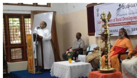
Launching of NRLM-DDUGKY Project – The official launching of NRLM DDUGKY Project was held at MSSS on 20 th May 2015.