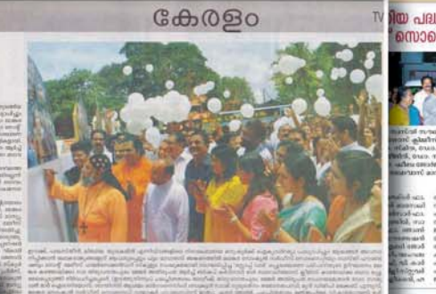
കോൺഫറൻസിന്റെ ഭാഗമായി സെന്റ് ഹാൽ തീരത്ത് നടന്ന കവിതാപരിപാടി. മലങ്കര സോഷ്യൽ സർവീസ് സൊസൈറ്റിയിൽ പങ്കെടുത്തവർക്ക് പരിപാടികൾ സംഘടിപ്പിച്ചു.

യുവജലിയിലെ കണ്ണിടകൾക്കു മുഖമേന്മ. കേരളത്തിലെ യുവജനങ്ങൾക്ക് മുഖമേന്മ നൽകാനും കഴിവു കൈമാറാനും മലങ്കര സോഷ്യൽ സർവീസ് സൊസൈറ്റി (MSSS) പദ്ധതികൾക്കു മുഖമേന്മ നൽകുന്നു. യുവജനങ്ങൾക്ക് കഴിവു കൈമാറാനും മലങ്കര സോഷ്യൽ സർവീസ് സൊസൈറ്റി (MSSS) പദ്ധതികൾക്കു മുഖമേന്മ നൽകുന്നു.