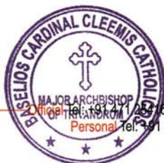
+Baslios Cardinal Cleemis Major Archbishop-Catholicos of Trivandrum President, Catholic Bishop's Conference of India

Official Tel: +91 471 2541642, 2541643, 2540446, Fax: +91 471 2541635, E-mail: catholicostvm@gmail.com Personal Tel: +91 471 2541331, Fax: +91 471 2533688, E-mail: baselioscleemis@gmail.com