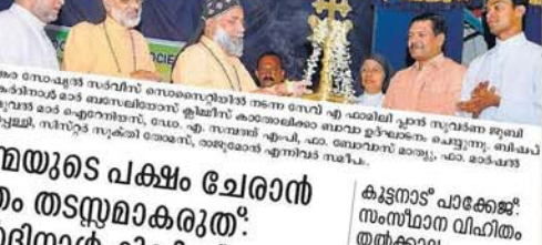
കോൺഫറൻസിന്റെ ഭാഗമായി സെന്റ് ഹാൽ തീരത്ത് നടന്ന കവിതാപരിപാടി. മലങ്കര സോഷ്യൽ സർവീസ് സൊസൈറ്റിയിൽ പങ്കെടുത്തവർക്ക് പരിപാടികൾ സംഘടിപ്പിച്ചു.

വനയികുട് മാർ ഗ്രിഗോറിയോസ് അ. വനയികുട് മാർ ഗ്രിഗോറിയോസ് അ. വനയികുട് മാർ ഗ്രിഗോറിയോസ് അ.