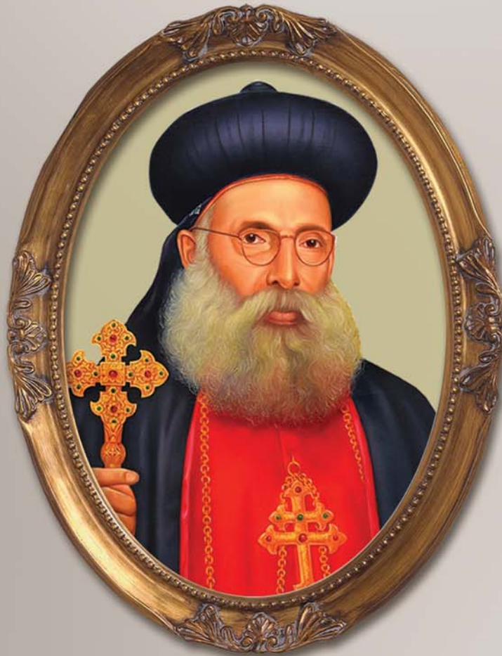
Servant of God Archbishop Mar Ivanios