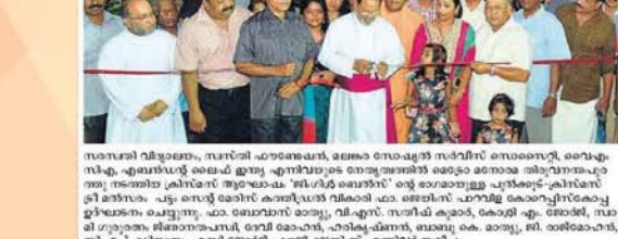
കോൺഫറൻസിന്റെ ഭാഗമായി സെന്റ് ഹാൽ തീരത്ത് നടന്ന കവിതാപരിപാടി. മലങ്കര സോഷ്യൽ സർവീസ് സൊസൈറ്റിയിൽ പങ്കെടുത്തവർക്ക് പരിപാടികൾ സംഘടിപ്പിച്ചു.

The Malankara Social Service Society (MSSS), has been made a member of the United Nations Academic Impact (UNAI). The MSSS will be working on various projects to improve the lives of the people in the region.