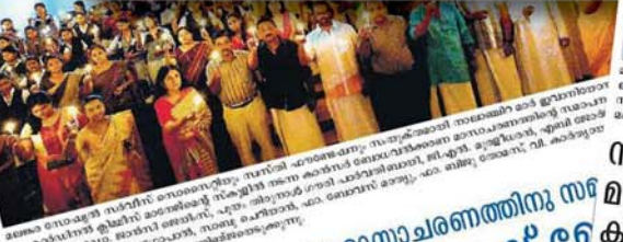
കോൺഫറൻസിന്റെ ഭാഗമായി സെന്റ് ഹാൽ തീരത്ത് നടന്ന കവിതാപരിപാടി. മലങ്കര സോഷ്യൽ സർവീസ് സൊസൈറ്റിയിൽ പങ്കെടുത്തവർക്ക് പരിപാടികൾ സംഘടിപ്പിച്ചു.

ജിംഗിൾ ബെൽസ് - ക്രിസ്മസ് ട്രീ, പുതുകൂട് മത്സരത്തിൽ വെട്ടുകാട് ക്രിസ്മസ് രാജ്യ ദേവാലയത്തിന് ഒന്നാംസ്ഥാനം. വെട്ടുകാട് ക്രിസ്മസ് രാജ്യ ദേവാലയത്തിന് ഒന്നാംസ്ഥാനം. വെട്ടുകാട് ക്രിസ്മസ് രാജ്യ ദേവാലയത്തിന് ഒന്നാംസ്ഥാനം.